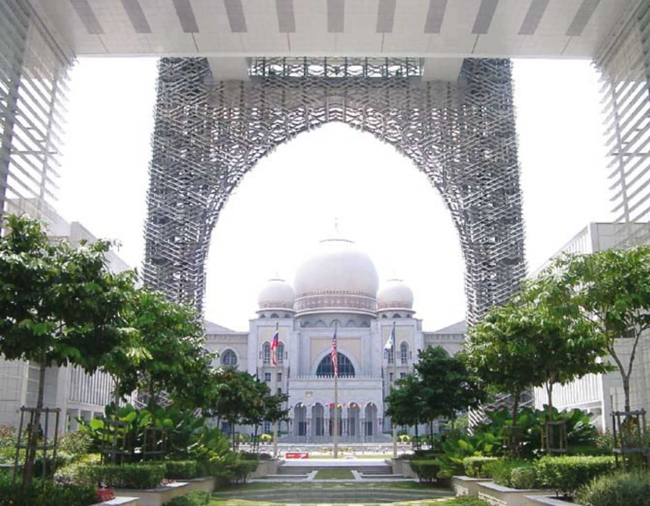
The Palace of Justice (Kompleks Kehakiman), Purajaya, seen here through the grand arch of the City Hall.

and residence but removed, to one side. Its lack of a place in the grand set pieces of the city only serves to reinforce PM, executive and bureaucracy.