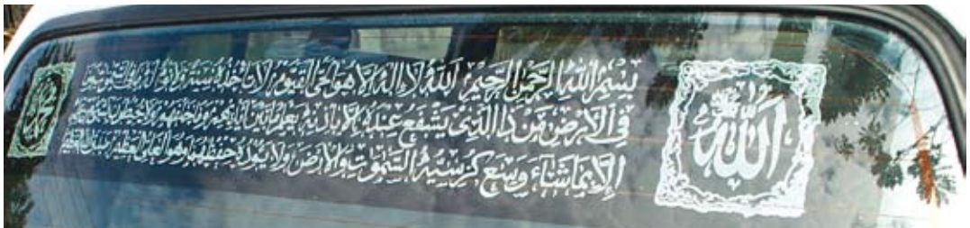
Islam on car rear window.

Quite literally, the homes of Malay middle-class families squeezed in between the mosques and the mall make up the stage on which the central theoretical and empirical problematics of the monograph are played out. Mosque and market in Malaysia are not only 'stages for the acting out of preordained parts; they are rather potentially 'fields of force', highly charged and full of social energy' (Gilsenan 2000: 173). Malay middle-class identity formation, I argue, should be