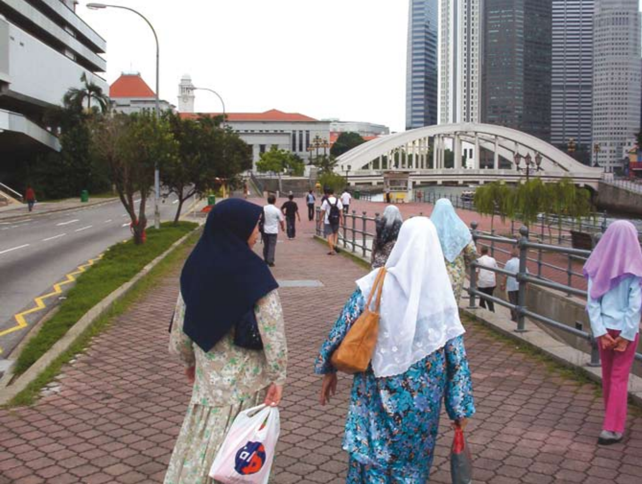
Wearing the tudung can exclude you from school, jobs and promotion. Photo by Michael D. Barr, 2003

shunning interracial activities, whereas it failed to criticise the majority of Chinese Singaporeans who mix almost exclusively with their own race. 3 Second, there is no evidence at all to support the suggestion that Muslims are centring their lives on the mosque.