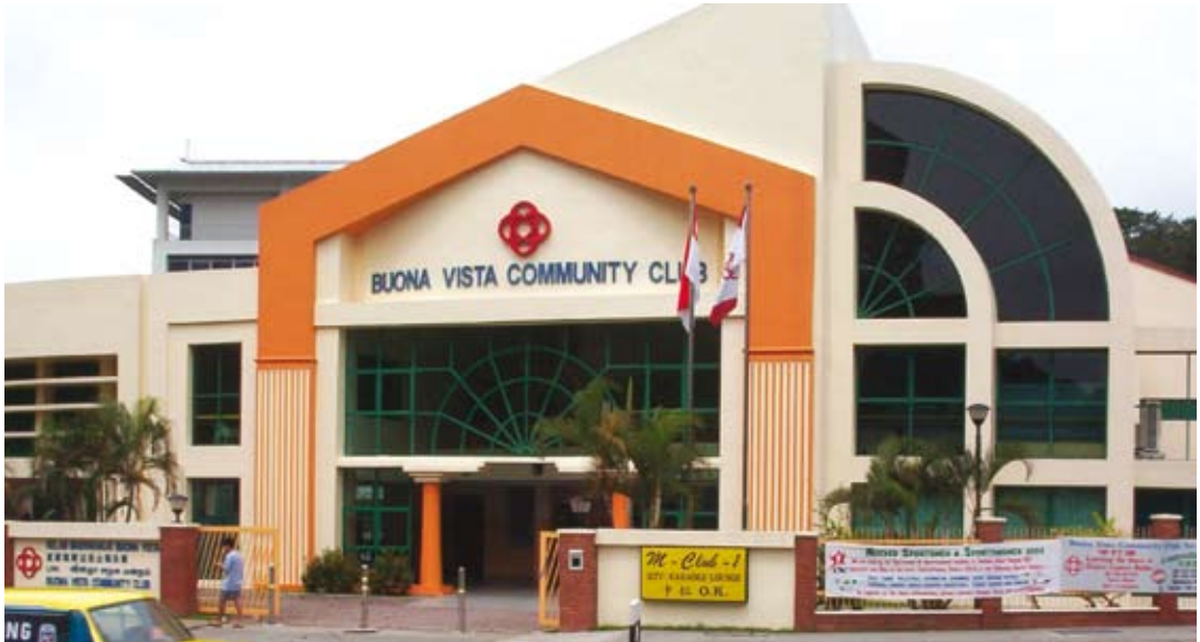
Buona Vista Community Club, Buona Vista. One of the mainstream, secular community centres shunned by Muslims.

could come to a mosque for sex education and young couples to join a family support network ( CyBerita , 22 November 2005). Bored or troubled youths could also come to mosques to engage in graffiti competitions, indoor netball and soccer and even rock climbing, as part of the outreach to youth ( ST , 29 July 2005). Families could join in the government's Family Ties social development programme through one of five mosques and they could call Family Help Lines based in mosques ( CyBerita , 15 November 2005 and 14 April 2006). Volunteers began door-knocking in the housing estates to seek out those in need, thus raising the profile of mosques immeasurably ( CyBerita , 27 October and 15 November 2005). MUIS was even using the MUIS Annual Grants under the Community Service Scheme to steer other Muslim bodies to use its preferred model of family assistance programme ( CyBerita , 6 April 2006). Whether one is looking for Mandarin classes, for the opportunity to volunteer for community work cleaning up the local beach, or for a pregnancy helpline, the mosque became the place to