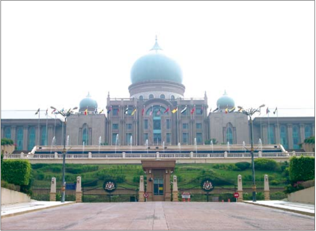
The Prime Minister's Office (Perdana Putra), Putrajaya. The use of domes is reserved exclusively for the Prime Minister's house and office, the Palace of Justice and the mosques.

that raise profound questions of identity, self-redefinition and uncertainty. These issues emerge in the matter of the city's imagery – style, but also the subjects of that style.