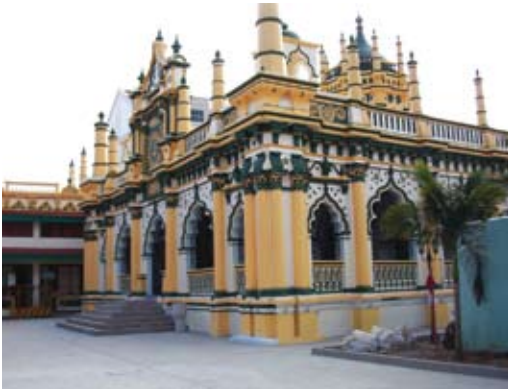
Abdul Gafoor Mosque: trying so hard to be relevant.

2005), increasing the integration of madrasah education into the mainstream system of PSLE certification ( Berita Harian , 11 July 2005) and improving the standard of teacher training in the madrasahs through courses run by the National Institute of Education and Edith Cowan University in Australia ( Berita Harian , 3 July 2005; CyBerita , 15 December 2005). Indeed the basic structure of MUIS and mosques has been drastically restructured to make it more professional, with the creation of a MUIS Executive Officer (CNA, 18 October 2005; CyBerita , 19 October 2005). Much more