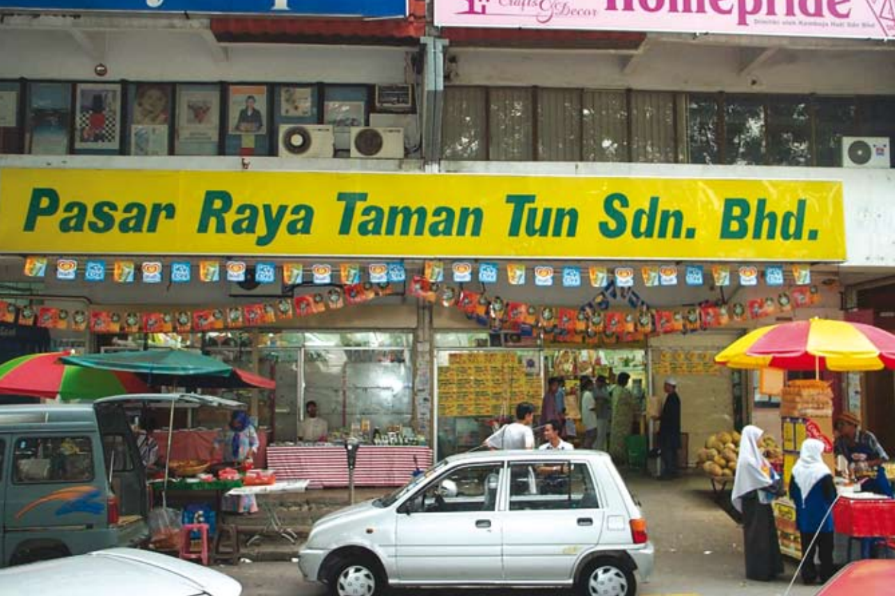
A mini-market, Pasar Raya, in suburban Malaysia. Outside, Islamic books, pamphlets, cassettes/ CDs and newspapers are on sale.

examined in the interfaces between these highly symbolically charged domains: on the one hand, the invocation of Islam as a world view and a performance of acts of piety, and on the other, a range of consumer practices and lifestyle choices made by, and within, families.