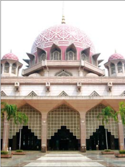
The Putra Mosque (Masjid Putra), Putrajaya.

and ‘immorality’ among Malay-Muslims; by the early 2000s this attention had escalated to raids on KL nightspots, mass arrests and systematic harassment. Not surprisingly, the rising zealotry has attracted reactions from moderate Malay-Muslims and the consequence has been increasing contestation and increasing community fragmentation.