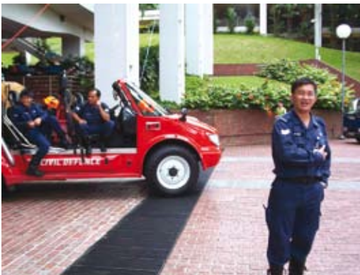
Malays engaged in a Civil Defence Force demonstration. Malay-Muslims are routinely shunted into the ranks of the Civil Defence Force and the Police for their National Service because the government does not trust them in the Army.

2005), increasing the integration of madrasah education into the mainstream system of PSLE certification ( Berita Harian , 11 July 2005) and improving the standard of teacher training in the madrasahs through courses run by the National Institute of Education and Edith Cowan University in Australia ( Berita Harian , 3 July 2005; CyBerita , 15 December 2005). Indeed the basic structure of MUIS and mosques has been drastically restructured to make it more professional, with the creation of a MUIS Executive Officer (CNA, 18 October 2005; CyBerita , 19 October 2005). Much more