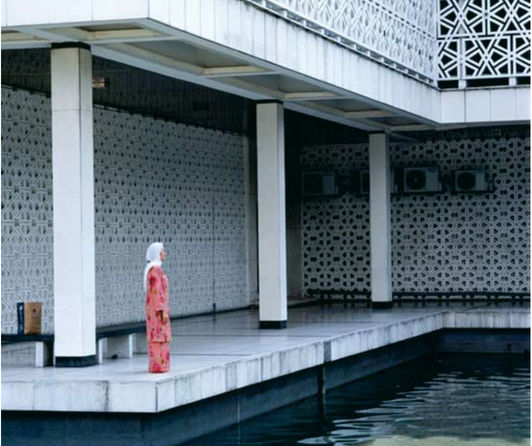
The national mosque in Kuala Lumpur.

been invited. The same kind of class was given at other mosques in nearby neighbourhoods and some of the teachers made appearances in several of these mosques.