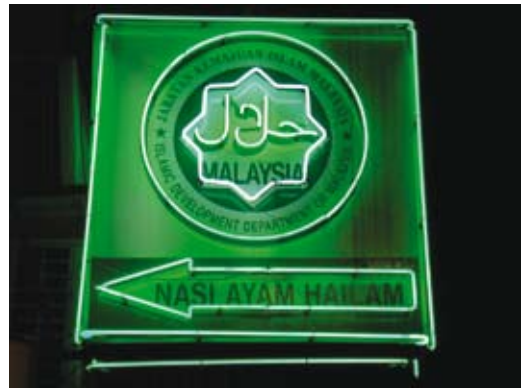
Halal logo issued by the Malaysian state.